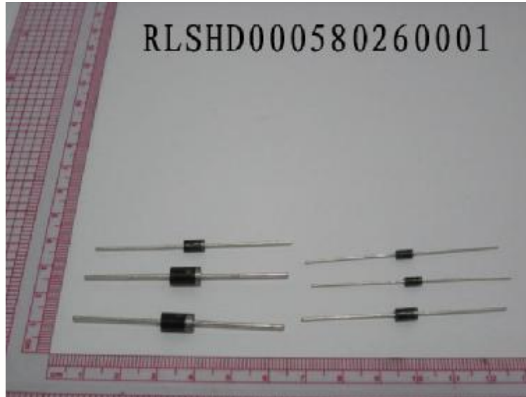
Photo of the sample